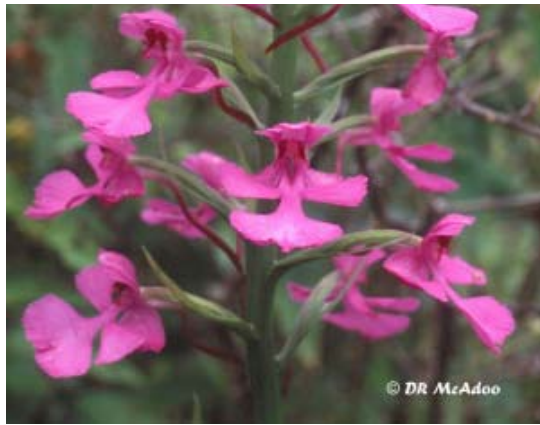
Platanthera peramoena – Purple Fringeless Orchid