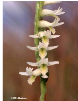
Spiranthes longilabris - Giant Spiral Orchid