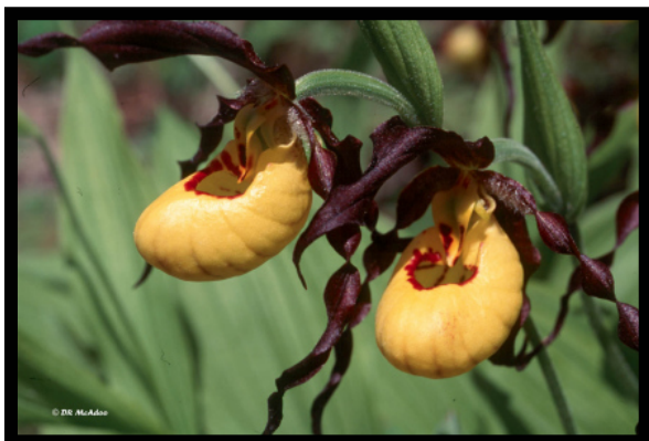
Cyripedium parviflorum var. parviflorum