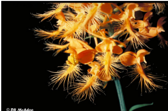
Platanthera ciliaris – Yellow fringed orchid

You don't have to travel far to see native orchids. Orchids probably grow in everyone's backyard. Goodyera pubescens , the Downy rattlesnake plantain, and Tipularia discolor , Crane fly orchid, can be found in almost every woods. Tipularia discolor bears a single, purple throated leaf in the winter and early spring; in the late summer/early fall, the plant blooms a spike of small brown and flesh colored flowers on a leafless inflorescence. Interestingly, these flowers are pollinated by male mosquitoes – and to think most people never thought that mosquitoes did anything worthwhile. The best seasons for finding natives are in the spring and then again in late summer. David's talk provided me with new inspiration to take my family on more hikes around the state. Almost all of native orchids defy cultivation and can only be observed and appreciated in their native environment, which is all the more reason spend time outside looking for these gems.