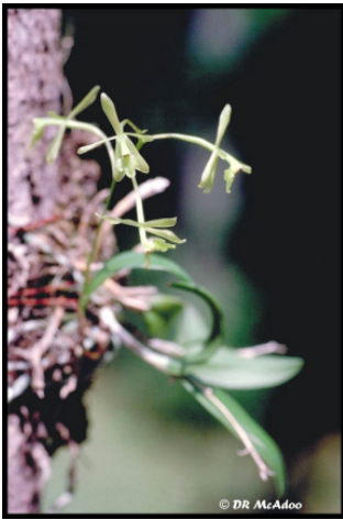
Epidendrum magnoliae – The green fly orchid