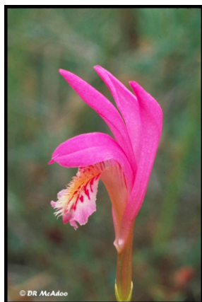
Calopogon multiflorus Arethusa bulbosa