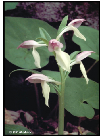
Galearis spectabilis – the Showy Orchid

(McAdoo continued from previous page) Some of the nicest orchids that David showed us were the Grass Pinks, e.g. Calopogon species. These plants grow on the coastal plain and bear extremely attractive triangular, pink flowers. Grass Pink flowers function as a teeter-totter “trap”. An insect is attracted to one side of the flower which collapses under the weight of the bug sending it and the pollen onto the column. Other native orchids were even more strange but equally beautiful. David showed us several examples of the saprophytic orchids called coral roots of the genera Hexalectris and Corallorhiza . Coral roots lack chlorophyll and cannot synthesize their own energy from sunlight. They feed off decaying matter and emerge from the leaf litter with spikes of tiny striped red, pink and brown flowers.