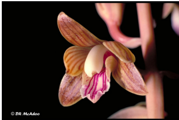
Hexalectris spicata , Crested Coralroot