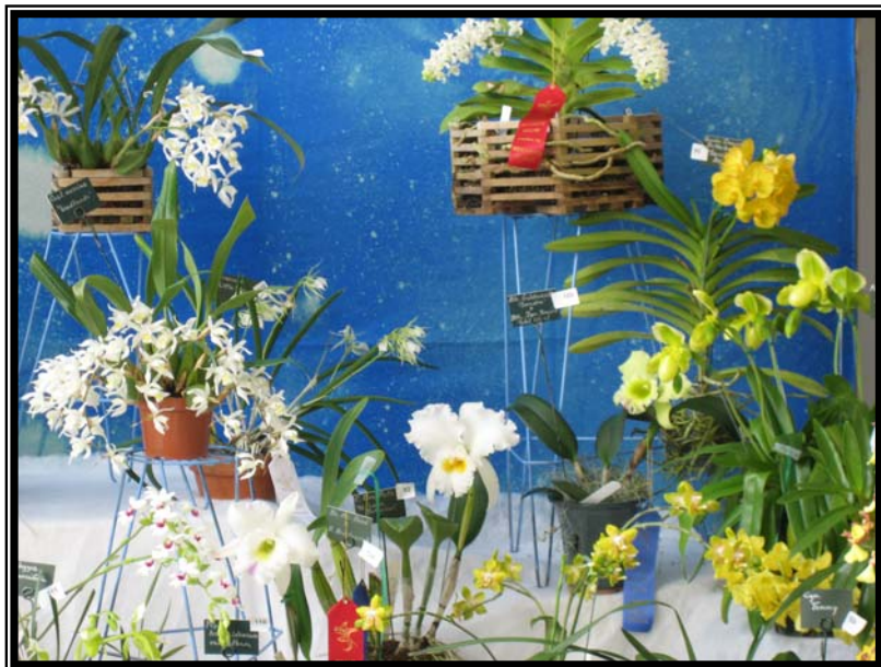
TOS Exhibit "Heavenly Orchids" 2007