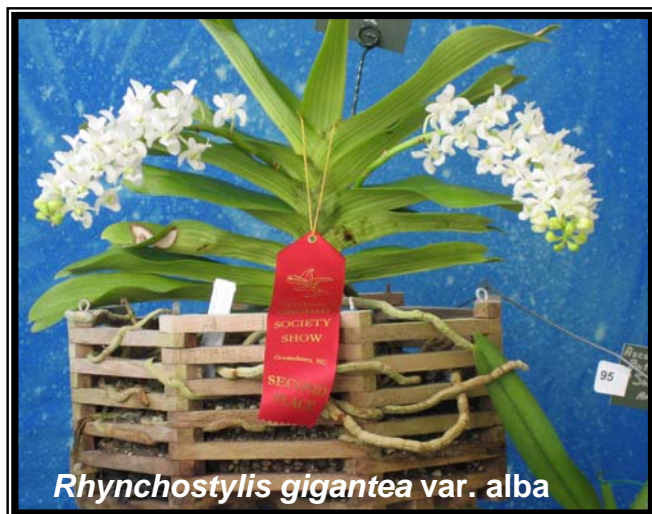
Rhynchostylis gigantea var. alba