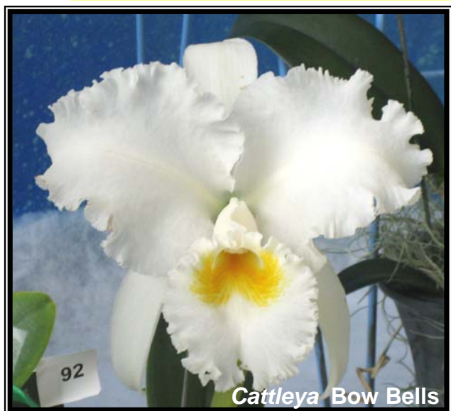
Cattleya Bow Bells